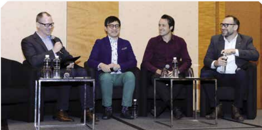
Panel discussion: Distribution perspective on smart technology in travel