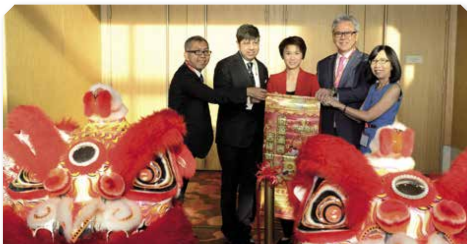
Opening ceremony of TRAVEX 2017