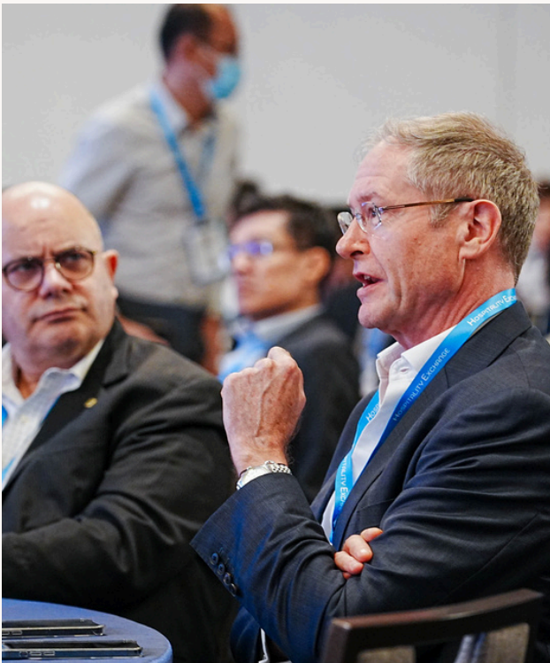
Audience participating in the panel discussion by posing a live question to the panelists.

Four main panel discussions formed the heart of Hospitality Exchange 2024. Over candid conversations, panelists delved into the complexities of integrating technology into the hospitality workforce without losing the personal touch and shared actionable strategies on embedding regenerative practices into business imperatives.